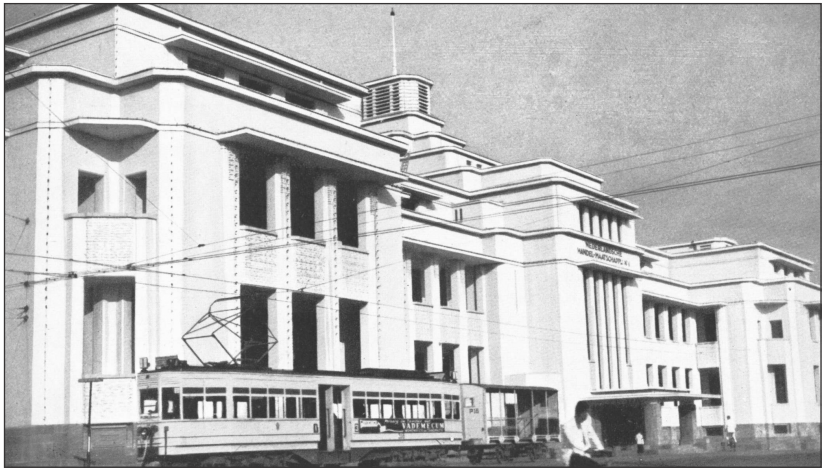
Ill. 2: Tweede Nederlandsche Handel Maatschappij 'de Factorij' in Batavia, (1931). Architect: A.P. Smits and C. van de Linde.

'to be of one's own time' nourished the architectural discourse throughout Europe and, although with some delay, the Dutch East Indies. The demand and search for a contemporary architectural style was partly inspired by the nondescript (characterless) nature of neo-classical architecture as a result of shallow, meaningless and sometimes incompetent application of pediments, columns, etcetera (Ill.2).