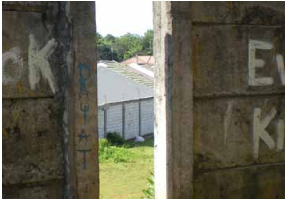
TOP AND BOTTOM: SOFT GATE. DESIGNED BY BUDI PRADONO ARCHITECTS, JAKARTA, INDONESIA

'Soft Gate', another project at the exhibition, deals with another exclusive urban space that is common to Jakarta: gated communities. 'Soft Gate' starts with an investigation of the subtle reciprocal relationships between inhabitants of gated suburbs and inhabitants of the kampungs and villages surrounding these suburbs. What the inventory indicates is that, despite the defensive way in which gated communities turn their back towards the rest of the city, the walls and gates surrounding gated suburbs are quite permeable. It is this conclusion that inspired the 'Soft Gate' team, to search for architectural and material forms that respond to, support and encourage these existing informal reciprocities – and thus contribute to diminishing the social and spatial divide between gated and non-gated communities.