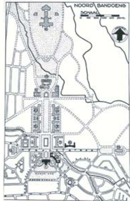
Revised Lay-out for the Departments (1938)

(*) Ph.D. candidate Delft University of Technology, The Netherlands