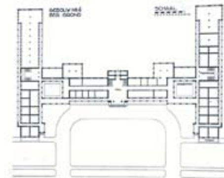
Ground Floor Plan for the Department of Justice (1938)