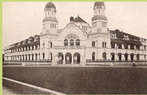
Semarang: Nederlands-Indische Spoorweg Maatschappij (1902)