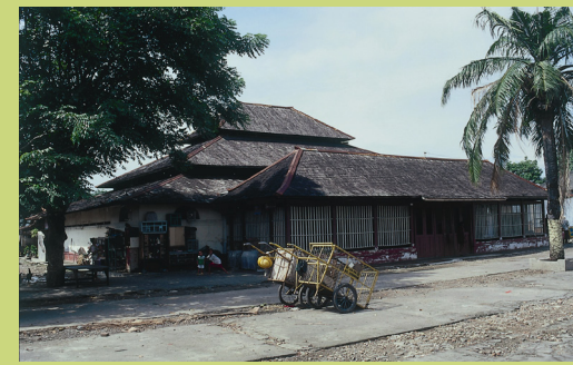
Semarang: People's Theater Sobokartti (1930)