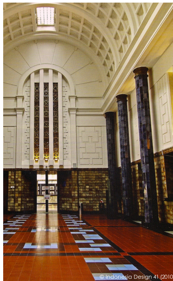
Jakarta: Javasche Bank (1909-1936)