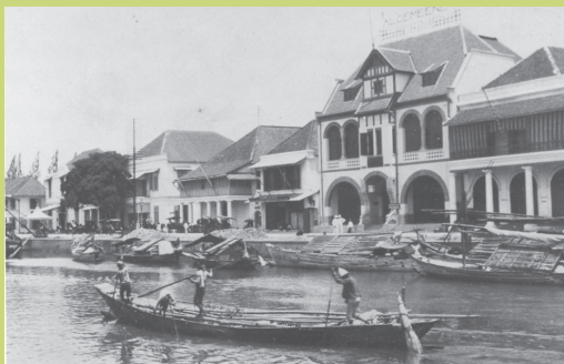
Surabaya: Insurance Company 'De Algemeene' (1900-1902)