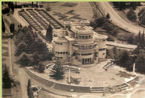
Lembang: Villa Isola (1931)