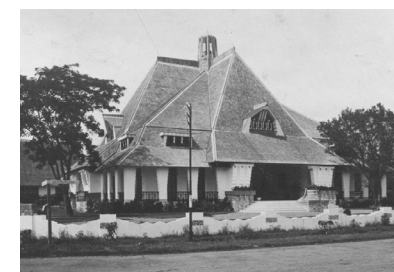
Surabaya: Javasche Bank (1921)