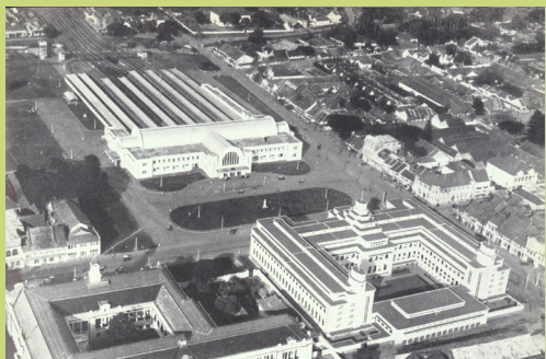
Jakarta: Station Square (1930s)