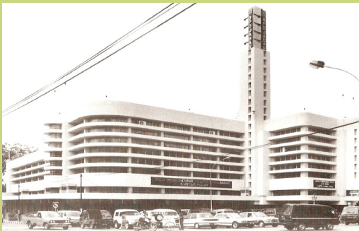
Bandung: De Eerste Nederlandsch-Indische Spaarbank (1935)