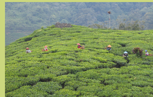
Parahyangan: Tea Plantation