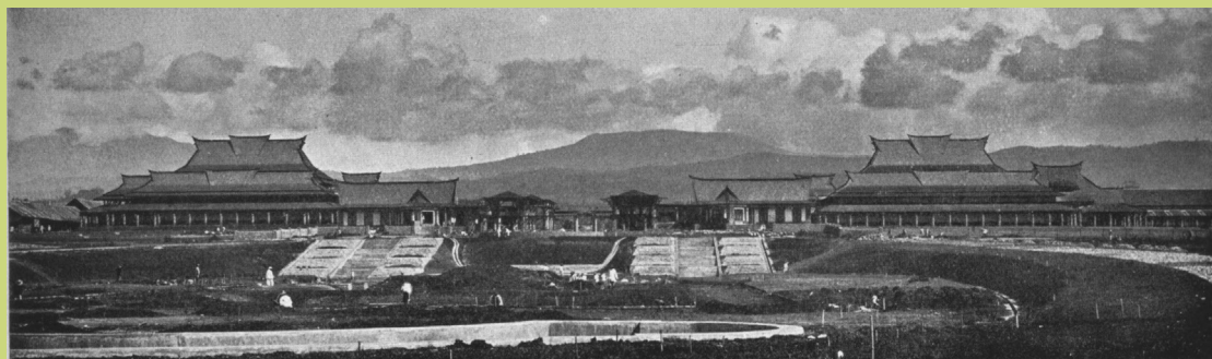
Bandung: Polytechnic (1920)